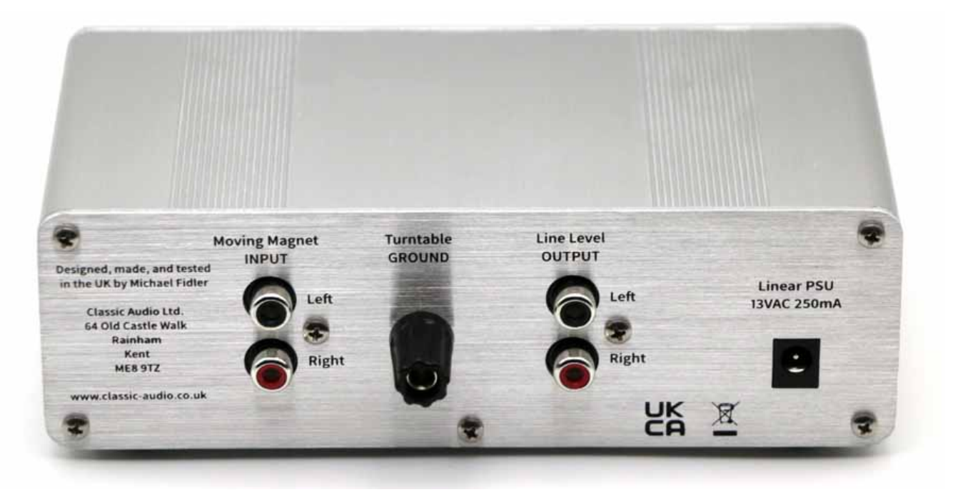
Classic Audio Spartan 10 MM phonostage rear panel

The Classic Audio Spartan 10 is the first product from this UK-based headed up by Michael Fidler. Janine Elliot spins some discs through this £350 moving magnet only phonostage.