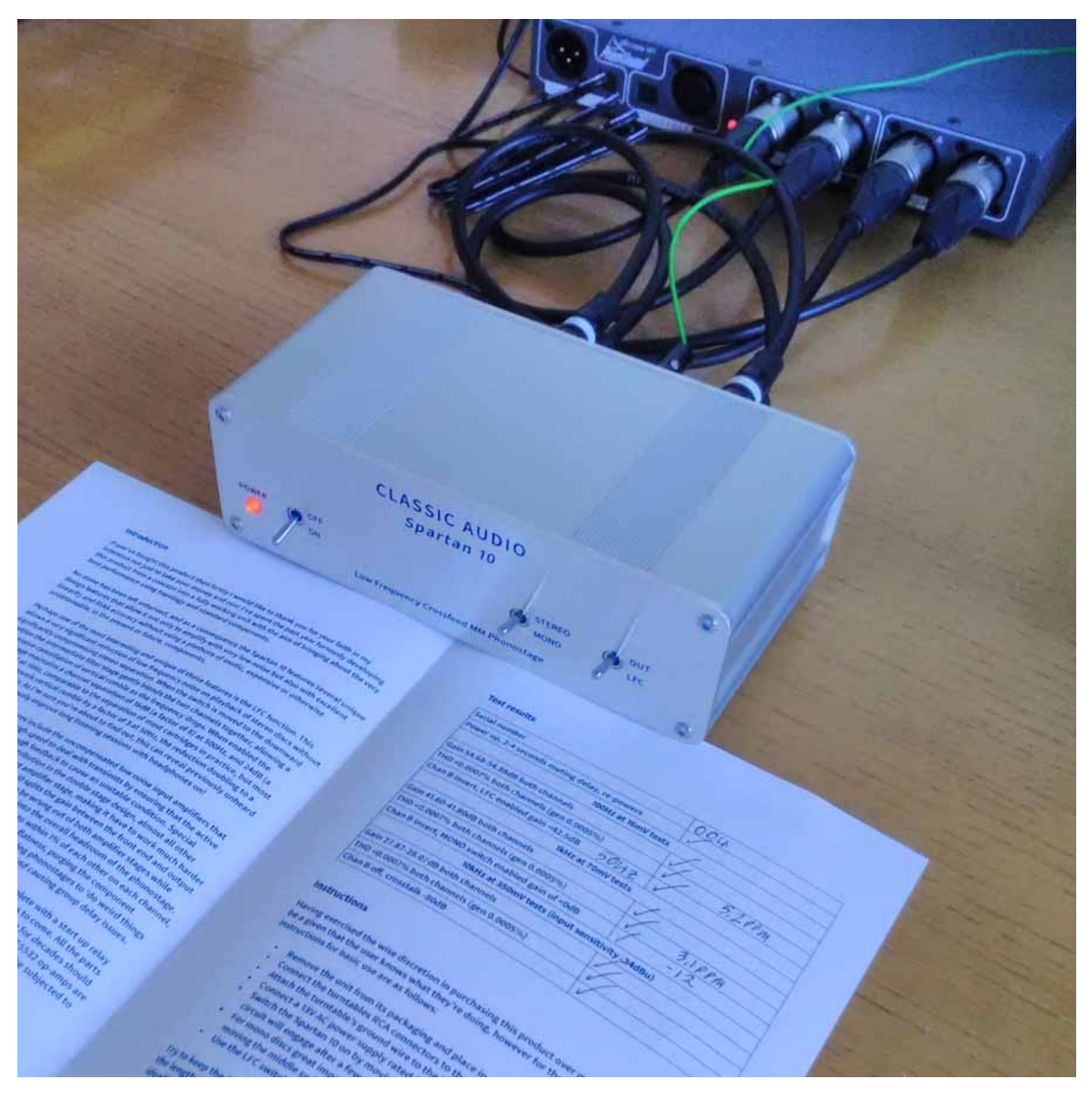
Testing the Classic Audio Spartan 10 MM phonostage

On the much higher priced Townshend Rock things really opened up and the excellence from such a cheaply priced phono-stage really showed its worth. 'Harbour Jazzband' is a trad' jazz band founded in 1956 in Rotterdam playing anything from Jelly Roll Morton to Duke Ellington. This was played with such elegance on the 2M cartridge with exquisite top end and tight and energetic bass. That subsonic filter kept the music decisive and in control with no 8-12Hz artefacts eating away at the music. There was plenty in reserve if the record had it.